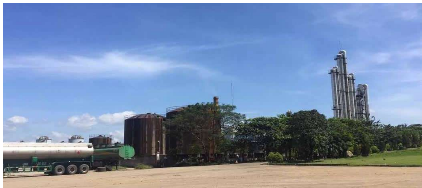
FIRI distillery in Ho Chi Minh City.

The level of sophistication of the technology must also be carefully looked at. As the technology is often meant to be replicated in the recipient country, it should be easily operated and maintained. Part of the plant manufacturing, if not all, should be transferred, so that spare parts would be easily available and repairs readily made, preventing long plant stoppages. This delocalization of the equipment production to DCs should not mean a reduction in quality; it should always be based on international technical standards.