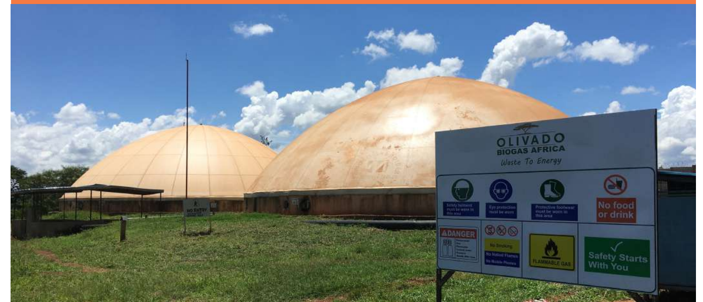
Biogas from avocado waste in Kenya.