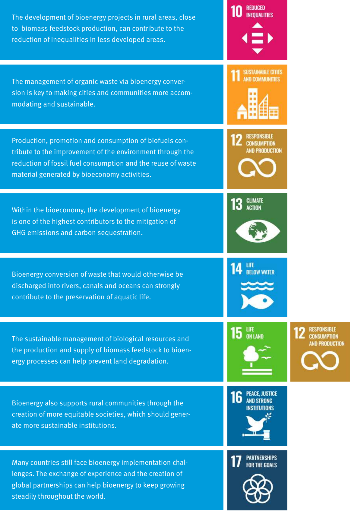
Table 1: Bioenergy and the SDGs