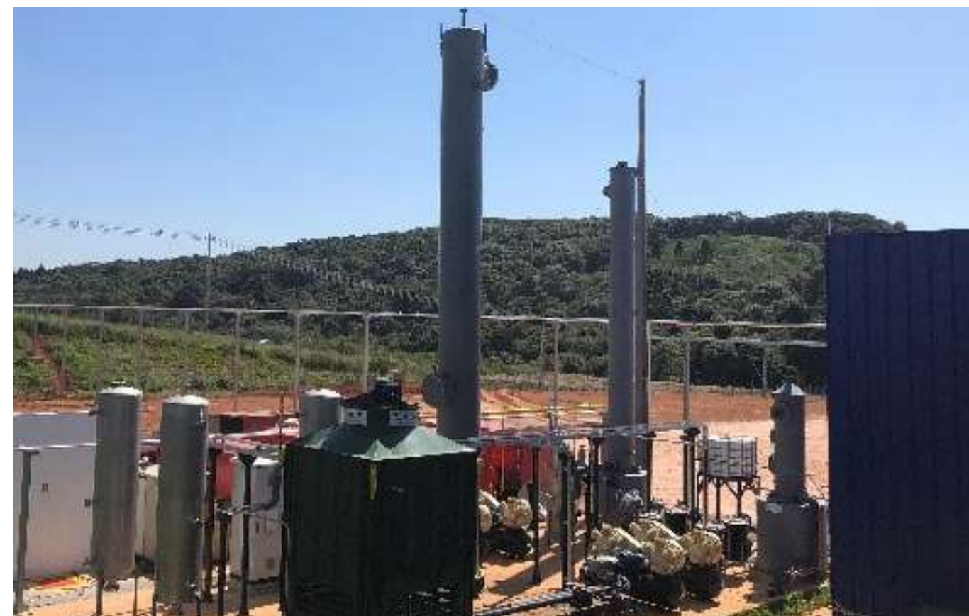
Biogas treatment plant in Brazil.

Bioenergy has a very promising future, as only a very small fraction of its potential has been exploited so far. Proven and reliable technologies are available and can provide solutions at household, community and industrial levels, provided that the biomass management and organization of the whole supply chain is well addressed. Capacity building at all levels is essential, along with public awareness campaigns on demonstration projects that have been successfully operated for a few years and their strong contribution to the achievement of the SDGs.