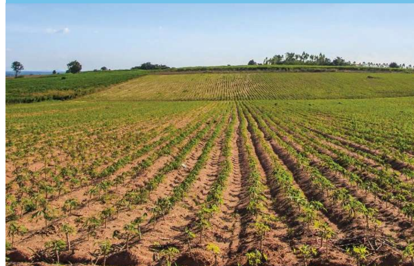
Cassava field in Thailand.