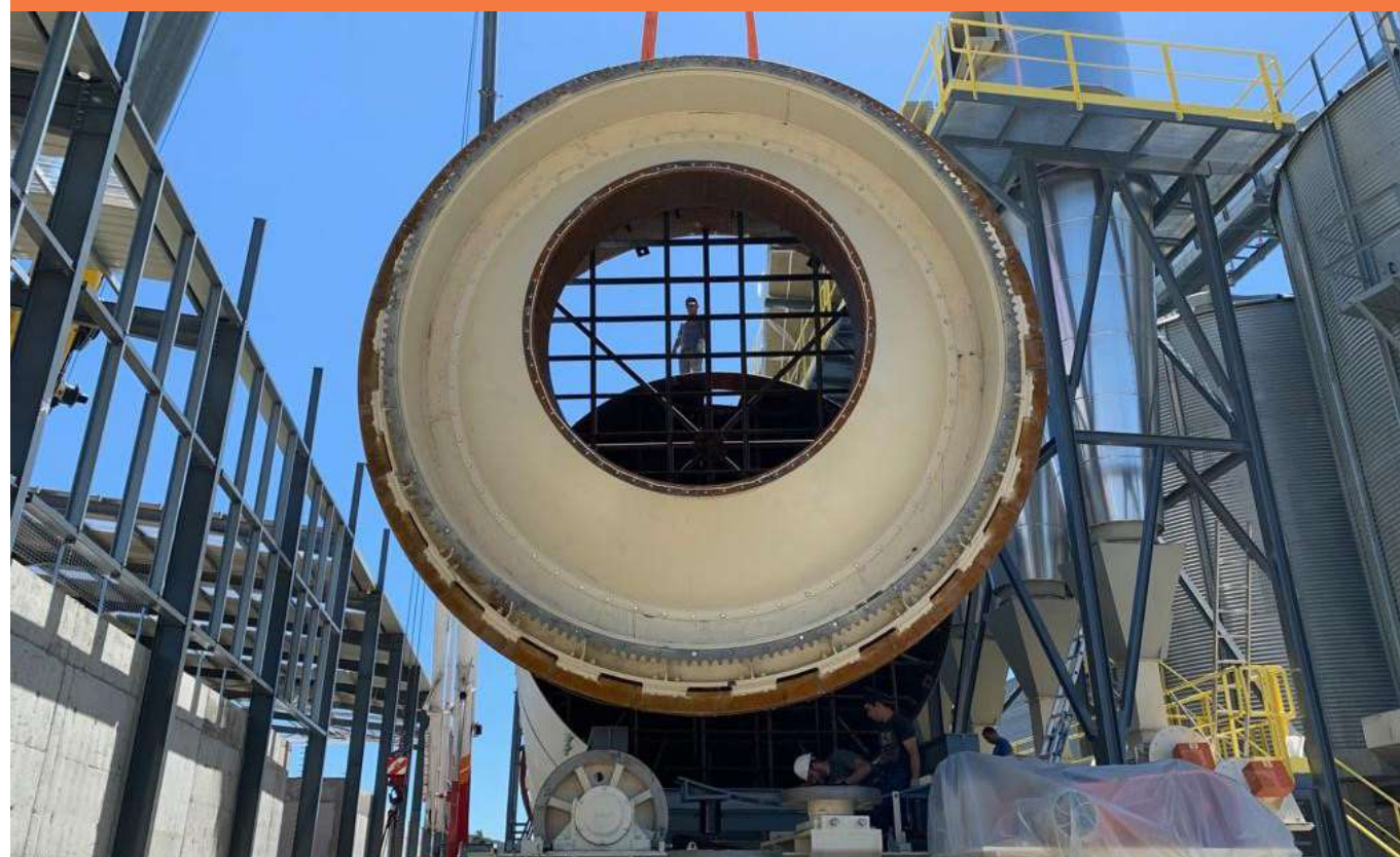
Installation of drying/torrefaction unit.