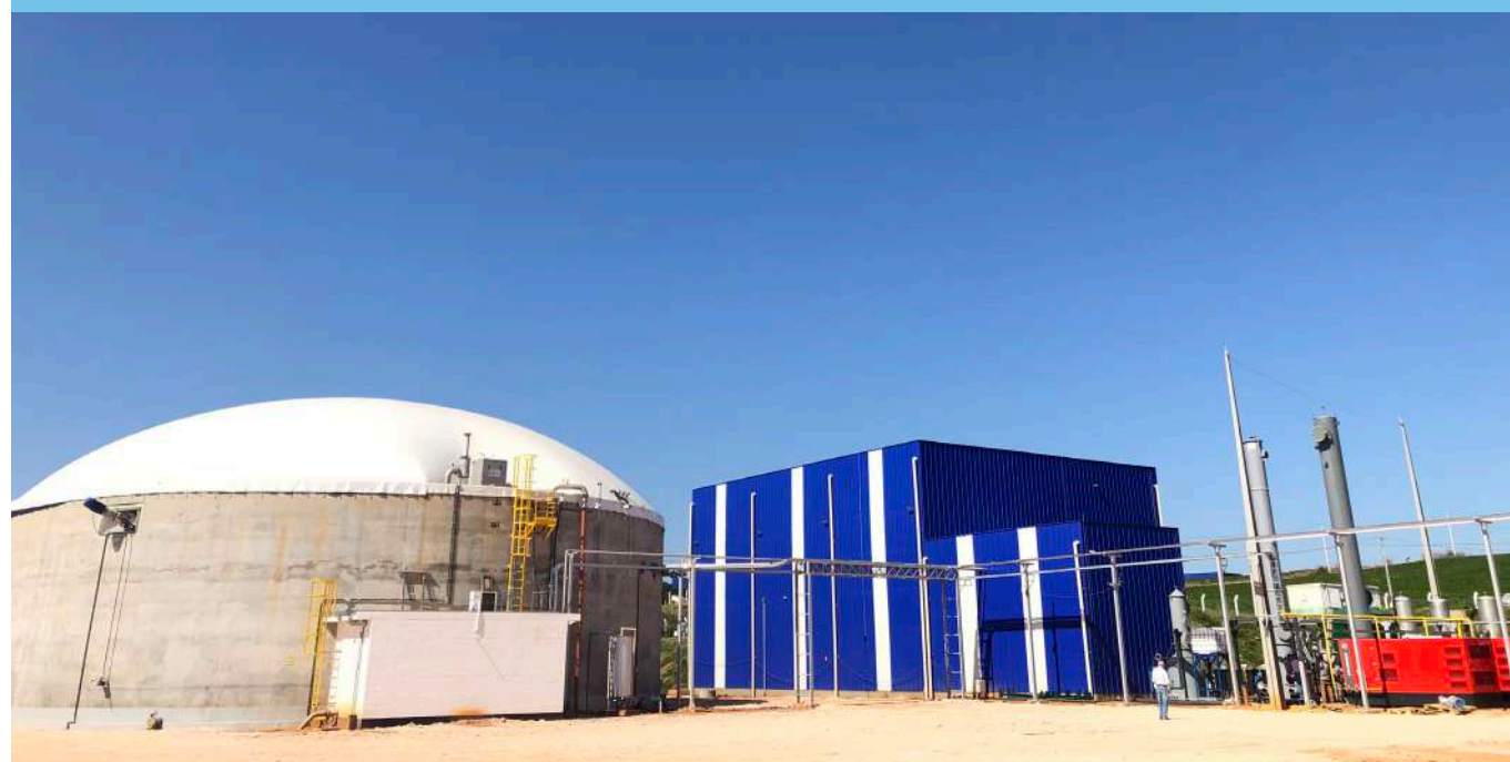
Biogas from agro-industrial residues.