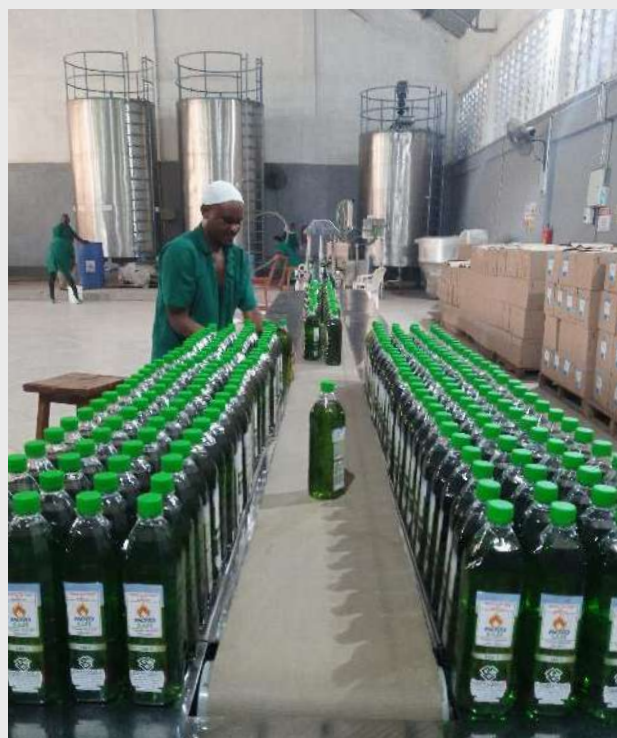
One liter bioethanol bottles ready for distribution.

Various financing issues were overcome during the project. Firstly, CCL was slow to obtain financing from its commercial bank to guarantee the Letters of Credit required to import stove parts from South Africa, resulting in an eight-month delay in the start of sales. The PSGF, to be seeded in capital from the Government of Tanzania, should be in place during