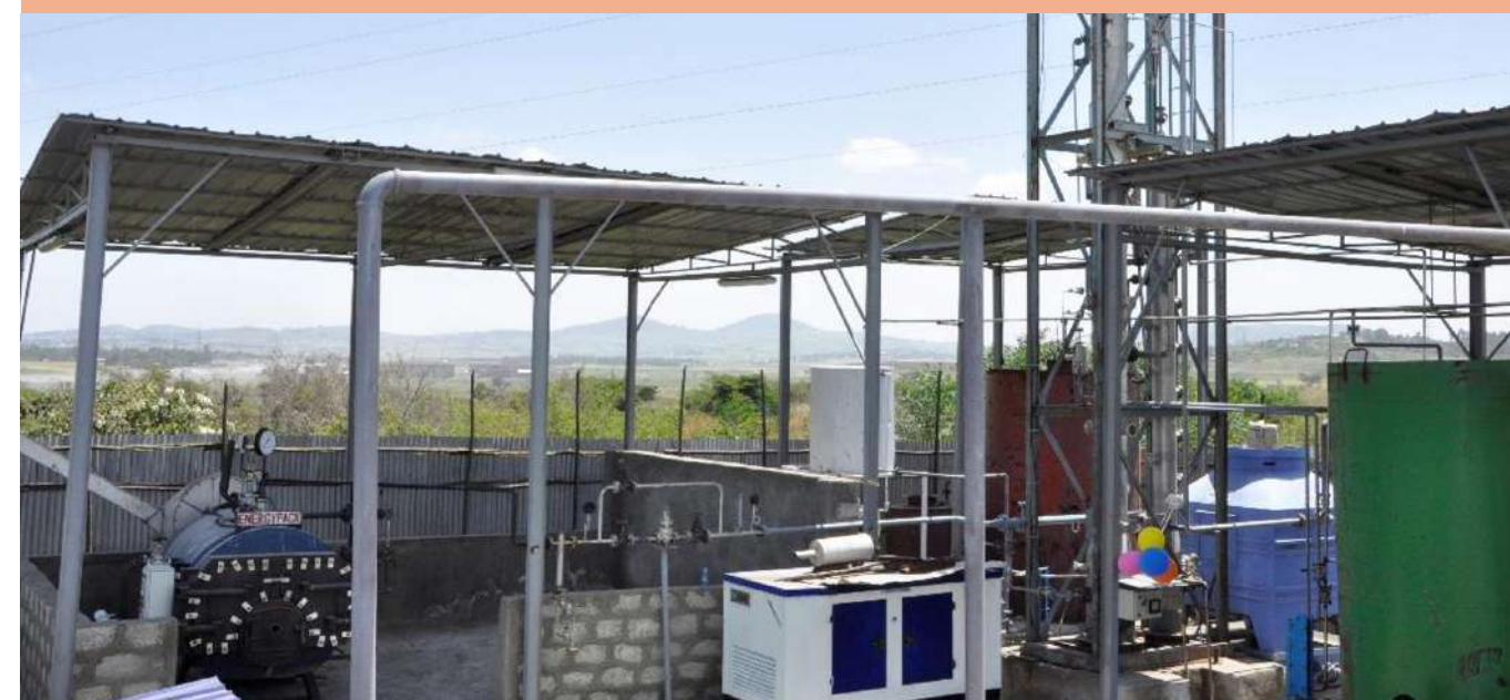
Gelan Distillery in Ethiopia.