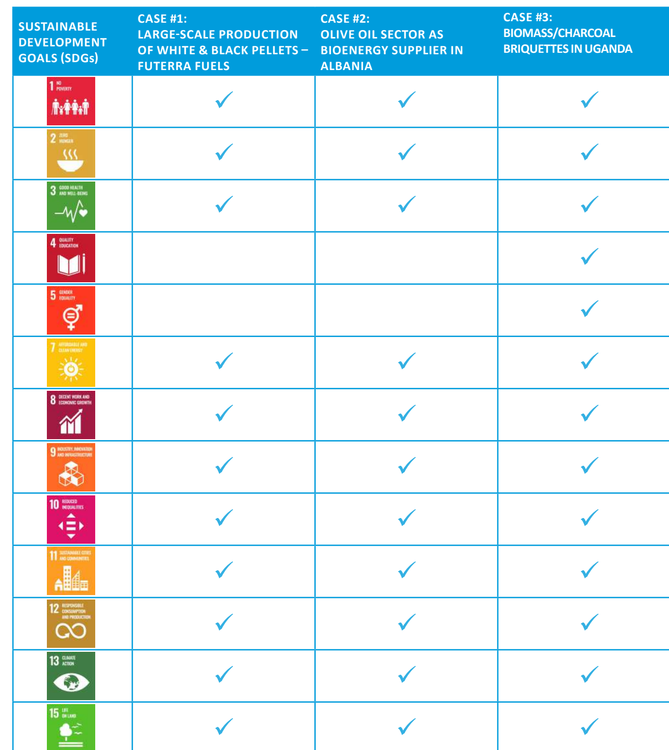
Table 2: Biomass and the SDGs

Due to the high investment required, financial support (grants, soft loans, incentives) is still a valid option to increase the number of projects in DCs and LDCs. There are too many examples of failed projects despite financial support from international organizations. There is a need to systematically check the factors that can lead projects to success and avoid mistakes that were made in the past.