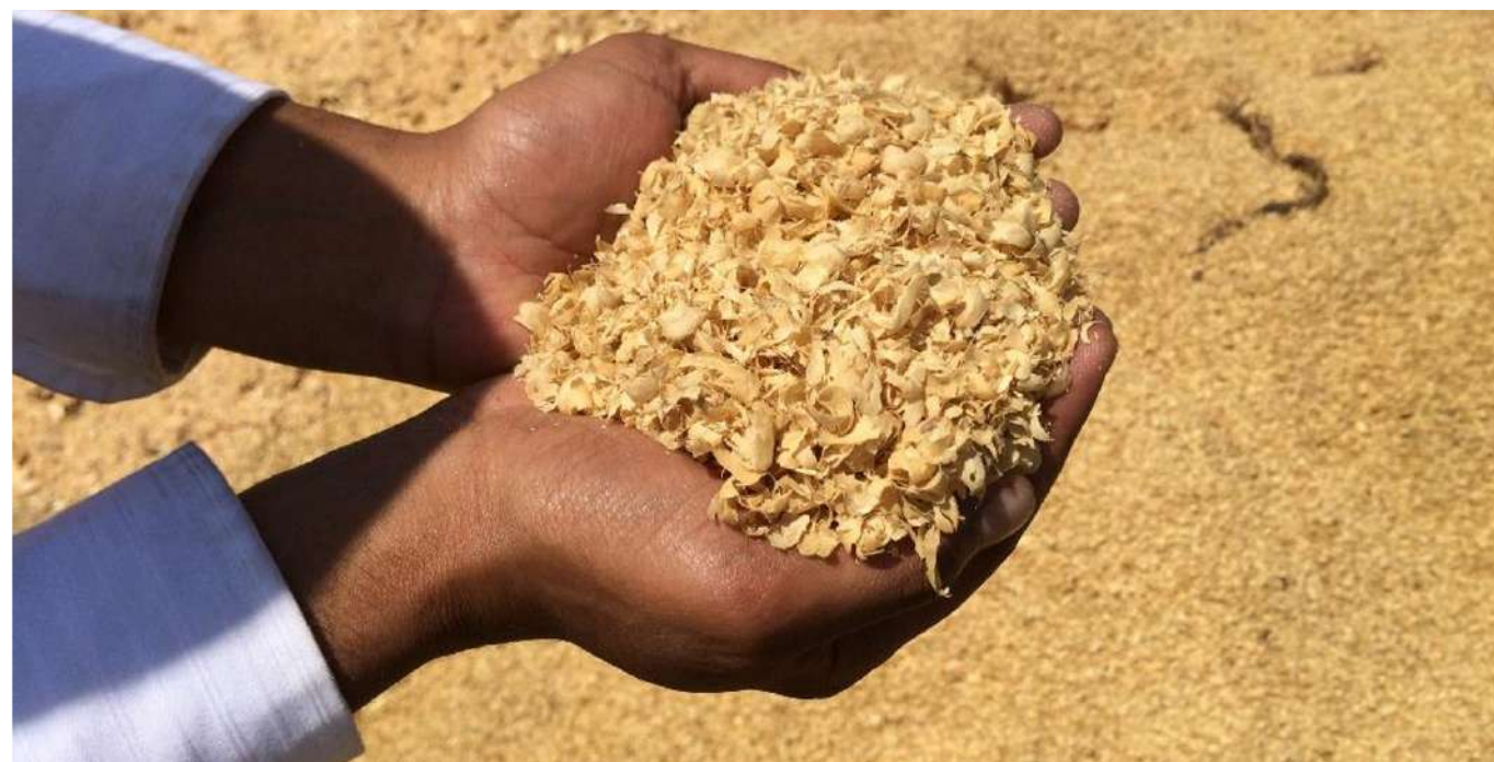
Gelan distillery boiler is able to burn low-grade biomass such as sawdust and coffee husk.

A detailed Monitoring, Evaluation and Learning (MEL) tool was developed for the Tanzania project that may be used as a guide for designing and executing future projects. As discussed in Case Study #1, the replicability of the project, which recommends to expand to 20 additional high impact countries, is predicated on a funding plan called PSGF and the Clean Cooking Social Facility, which provides donors and investors with the opportunity to invest in measurable progress in addressing the SDGs. Because clean energy and biofuels address so many of the SDGs, these projects lend themselves well to the MEL strategy. This provides the ideal guide for future work.