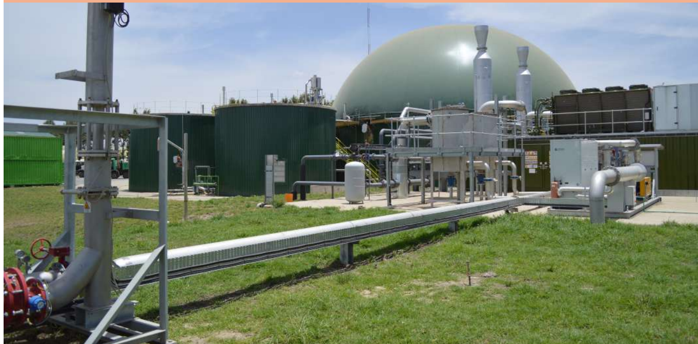
Biogas plant in Naivasha, Kenya.