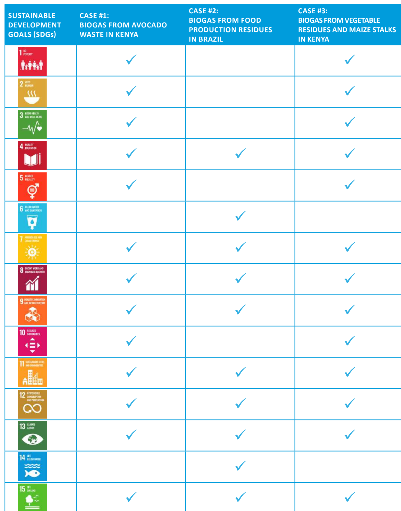
Table 3: Biogas and the SDGs