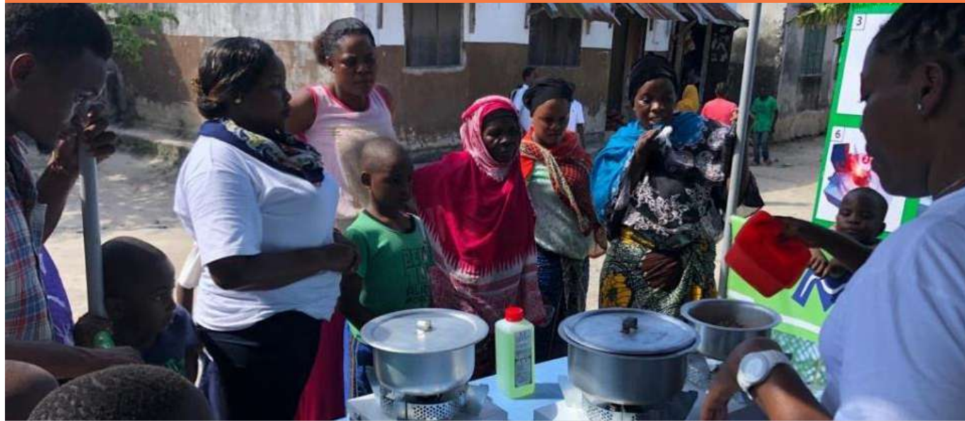
Selling cook stoves at a local market.