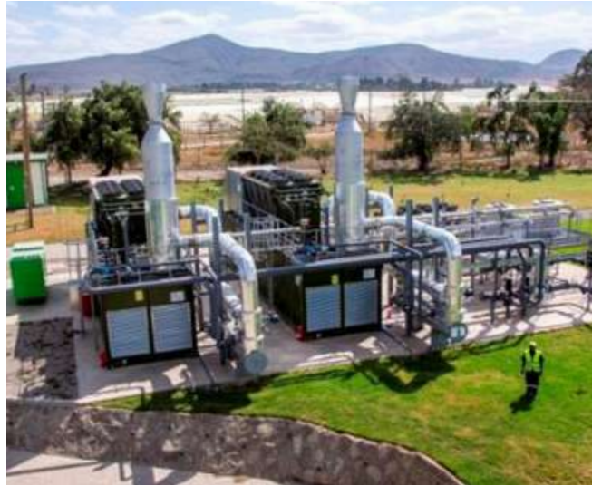
Biogas plant in Kenya.

Investing in environmentally friendly projects using RE is a long-term investment. As biogas plants will run for decades, the weight of the O&M costs gets higher over time.