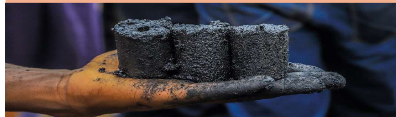
Charcoal briquettes.