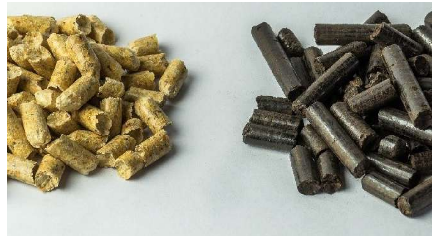
White pellets from debarked wood and black pellets from torrefied wood.

A more sustainable alternative is the use of local biomass in modern, efficient and low-emission equipment instead of conventional technologies. This would create local jobs and keep value added in the region mainly via small companies. As shown in the three case studies presented further on, modern biomass appliances may lead to poverty reduction and more gender equality.