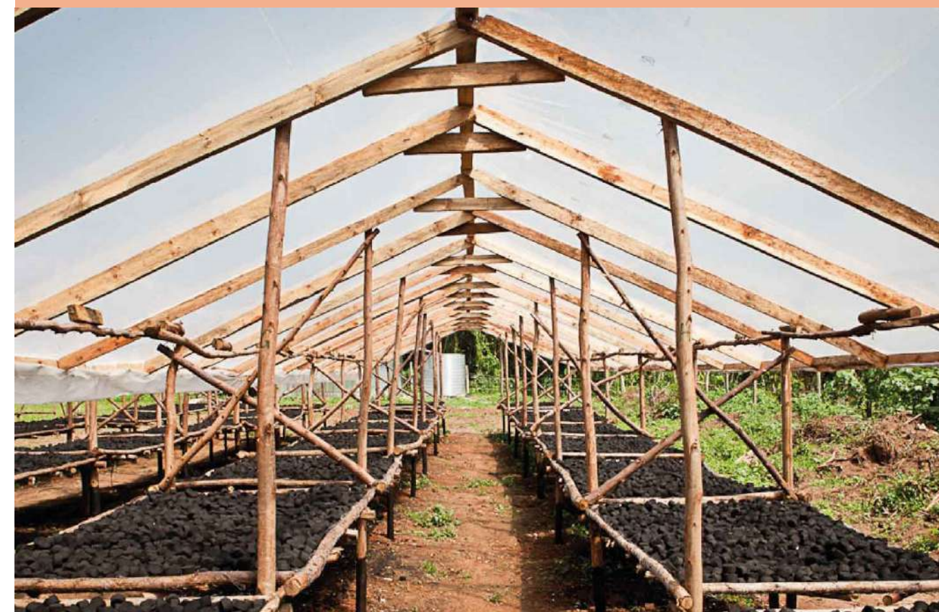
Charcoal briquette drying.