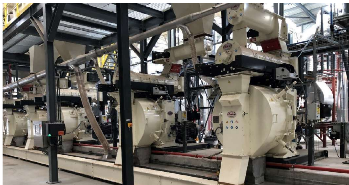
Pellet presses in Portugal.

The legislation must be adapted to include equipment quality and efficiency requirements. Therefore, it is recommended to establish and implement a quality control system, with an incentive program, a monitoring system and the necessary infrastructure, including testing, certification, accreditation and mechanisms for market surveillance. The regulatory framework should include the adoption of international standards for bioenergy equipment and encourage technology transfer.