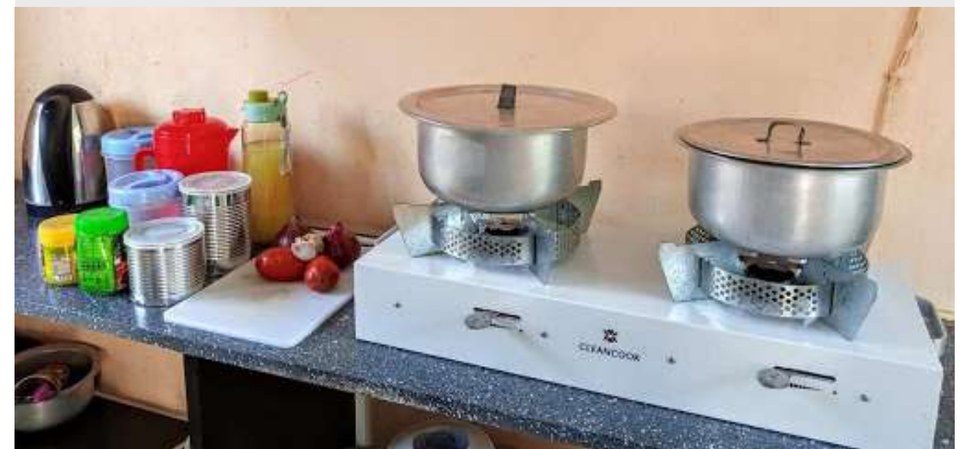
Twin burner cook stove in Tanzania.

CCL began selling stoves in earnest in February 2020. To date, they have sold approximately 1,000 stoves in their assigned territory in Dar es Salaam. Just as sales volumes were on the rise, the COVID-19 pandemic hit Tanzania and Dar es Salaam went into quarantine. As a result of a government request, CCL quickly adapted to the situation to produce hand sanitizer. They joined Tanzania's largest ethanol producer, Kilombero Sugar, in donating pharmaceutical-grade ethanol to the effort. This was an opportunity for CCL to remind the public about clean cooking with ethanol, sharing the message: "Clean Hands, Clean Fuel, Clean Air."