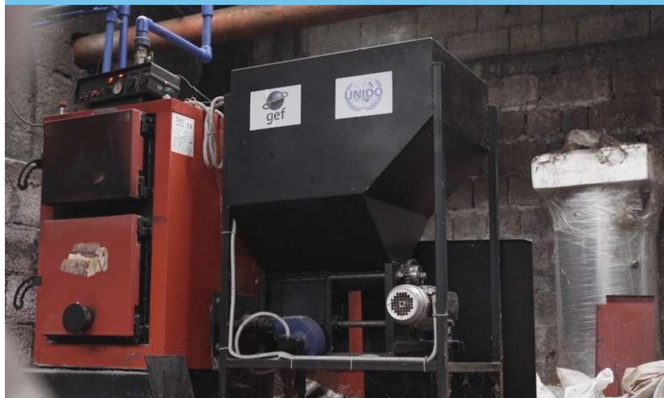
Combustion system for dried olive pomace in an olive factory.