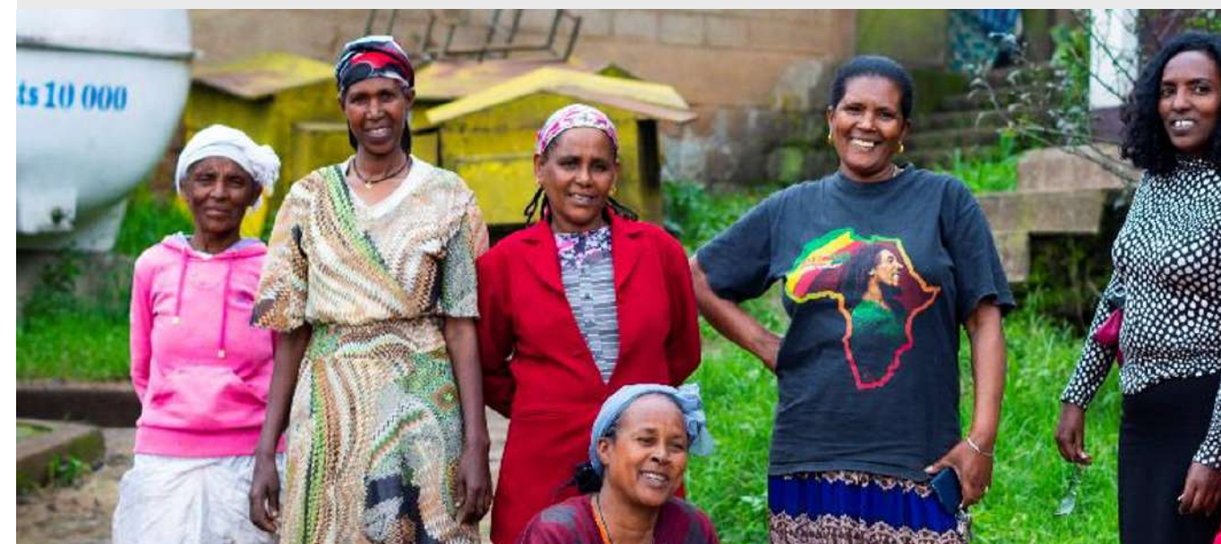
Some of the women from the Former Women Fuelwood Carrier Association (FWCA). In the background (top left), the ethanol storage tank in the FWCA compound.

The most difficult obstacle to overcome was the loss of the FWCA's original building site. The new site was less suitable due to its size, location, soil structure and lack of an all-weather road. The Ethiopian Electric Power Company was slow to serve the site. Additionally, due to its location on the border of the Addis Ababa administrative state and the Oromia Regional State, the distillery was damaged during political unrest in 2019. Gaia and the FWCA are currently making plans to move the distillery to a new location, where it can be safely re-erected, maintained and operated.